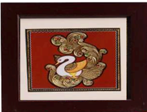
Tanjore Painting Swan

Brand : Khadi India Style : Tanjore Dimension : 9x9"